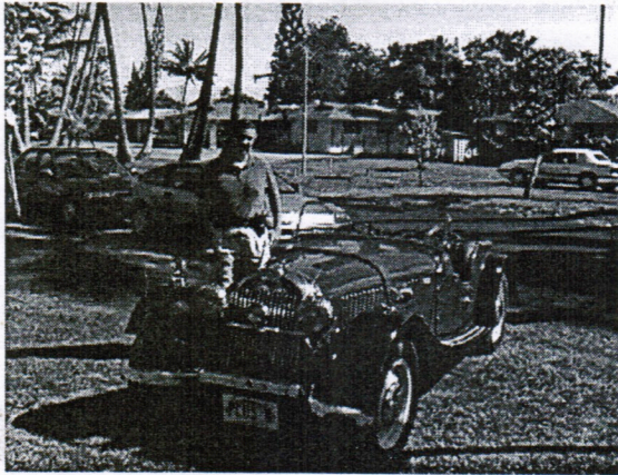
TWO GREAT MORGAN!!