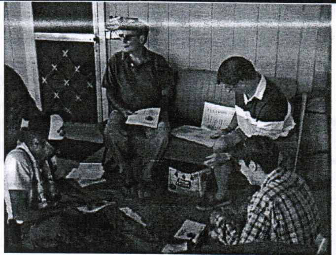
THE TROOPS FOLDING, ADDRESSING AND STAMPING NOV. NEWSLETTER!!